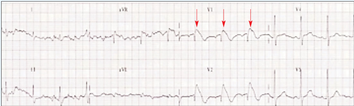
Figure 2. ST elevation with incomplete right bundle branch block (red arrows)