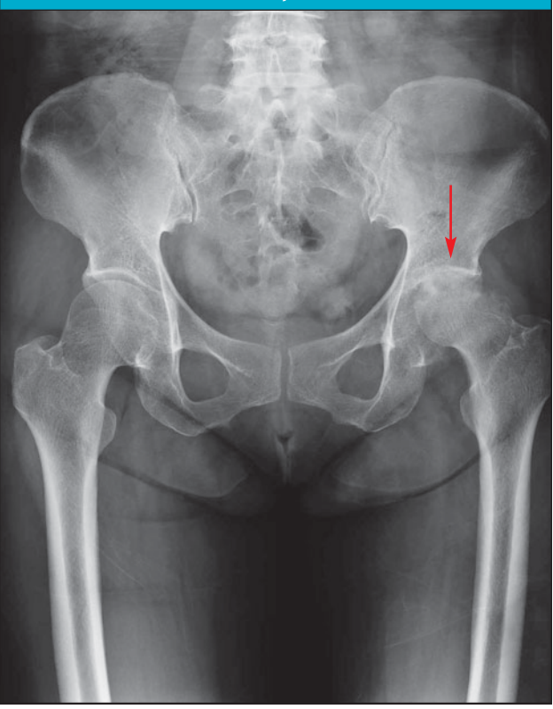
Image 1. X-ray Image of Female Patient With Osteoarthritis of the Left Hip

Image 2. X-ray Image of Female Patient With Osteoarthritis of the Right Hip